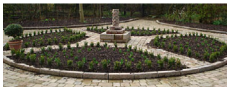
The restored Bothy gardens