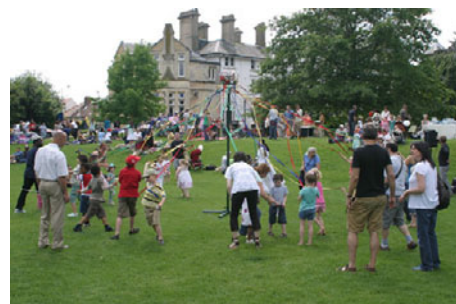
Spring in the gardens

You can find details of our other partners on the Avenue House web site, which has a full list of them.